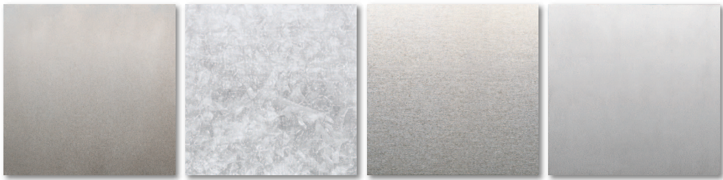
Steel Sendzimir-galvanised Aluminium Stainless steel